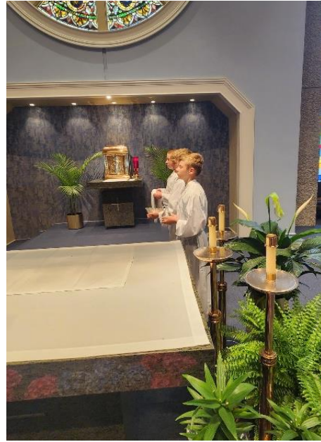
DO THIS (2 different angles)