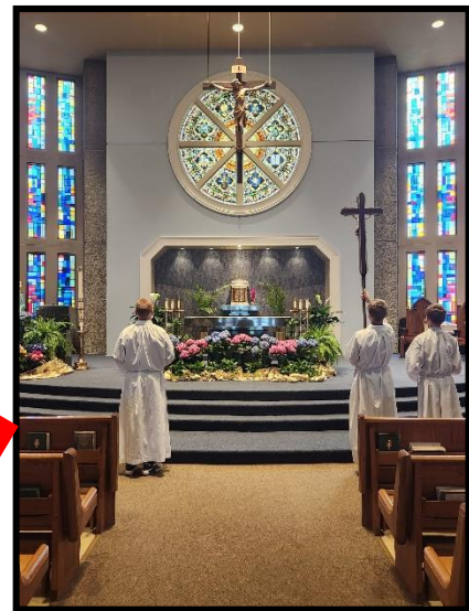
DO NOT DO THIS